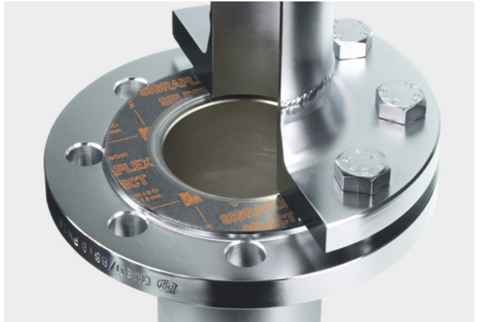
↑ Flange with SIGRAFLEX SELECT gasket