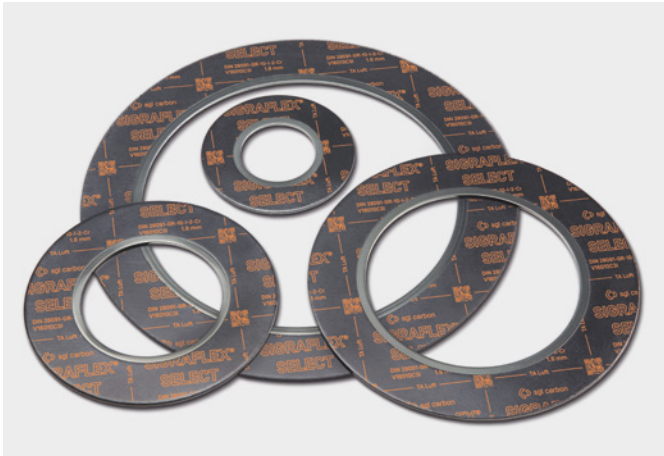
↑ Gaskets made from SIGRAFLEX SELECT